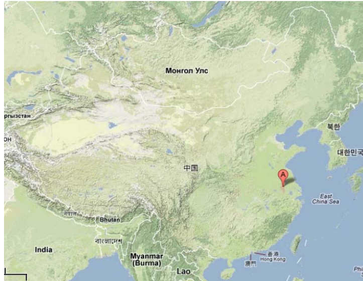
Figure 1: The location of Nanjing in China

Nanjing is the provincial capital of Jiang Su province, and is the first "China's Well Known Software City" determined by the Ministry of Industry and Information Technology of China.