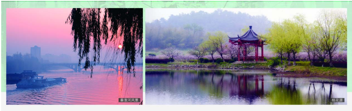
Figure 3 Beautiful Environment of the Valley

China (Nanjing) Software Valley has beautiful environment and convenient traffic condition. The Valley relies on Niushou Mountain, Jiangjun Mountain, Hanfu Mountain, neighboring Yangtze River and New Qinhuai River, and enjoys forest, water and lake resources. The greening coverage ratio of the valley reaches up to over 50%. It takes 20 minutes to reach Nanjing Lukou International Airport, 10 minutes to reach the downtown center of Nanjing City. The Asian biggest railway station, Nanjing South Station of High-speed Railway, is located in the Valley, and it takes only 1 hour to directly reach Shanghai, 3 hours to reach Beijing.