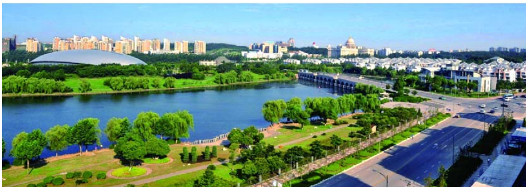
Figure 2 Overlook part of China (Nanjing) Software Valley

China (Nanjing) Software Valley is a dispatched institution of Nanjing municipal government. It is located in the south of main urban area of Nanjing city, covering a planned area of 70 square kilometers. China (Nanjing) Software Valley aims to be a professional high tech cluster, which focuses on software and ICT service industries, and it is built based on advanced development strategy, emphasizing equilibrium, creating wealth and enjoying work in this land. In 2011, the output value of software and ICT service industry in the Valley exceeded 52 billion Yuan RMB, and it is predicted to reach 200 billion Yuan RMB in 2015, with over 400 thousand software personnel.