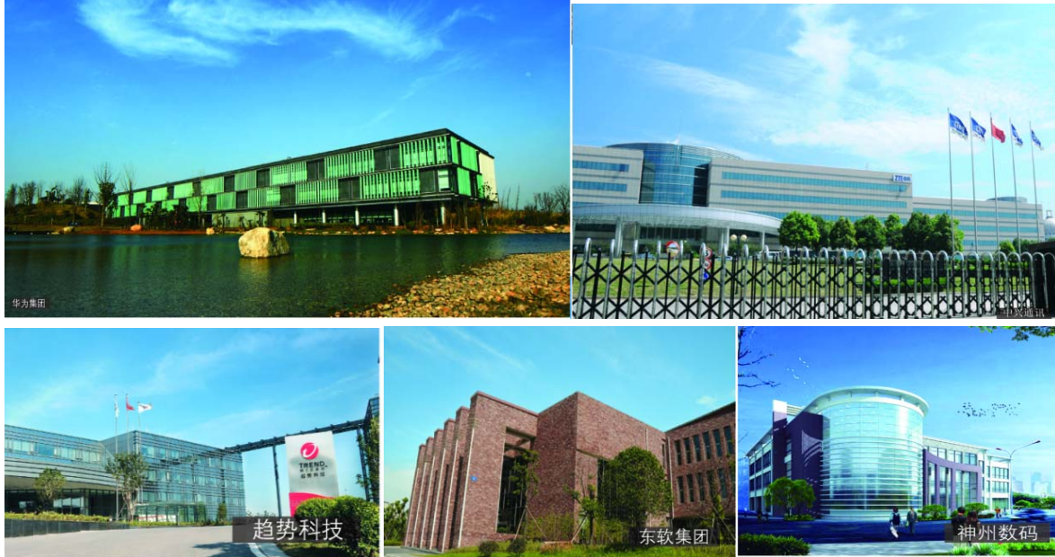
Figure 5 Leading Enterprises in the Valley

China (Nanjing) Software Valley has already formed industrial clusters of communication software, software outsourcing and information services. The core area has attracted over 330 software enterprises, including IBM, Dell, Trend, Marvell, Vance INFO, HUAWEI, ZTE, Potevio, Neusoft, Softstone, Hoperun, and the Valley is also promoting cooperation with other global ICT giants.